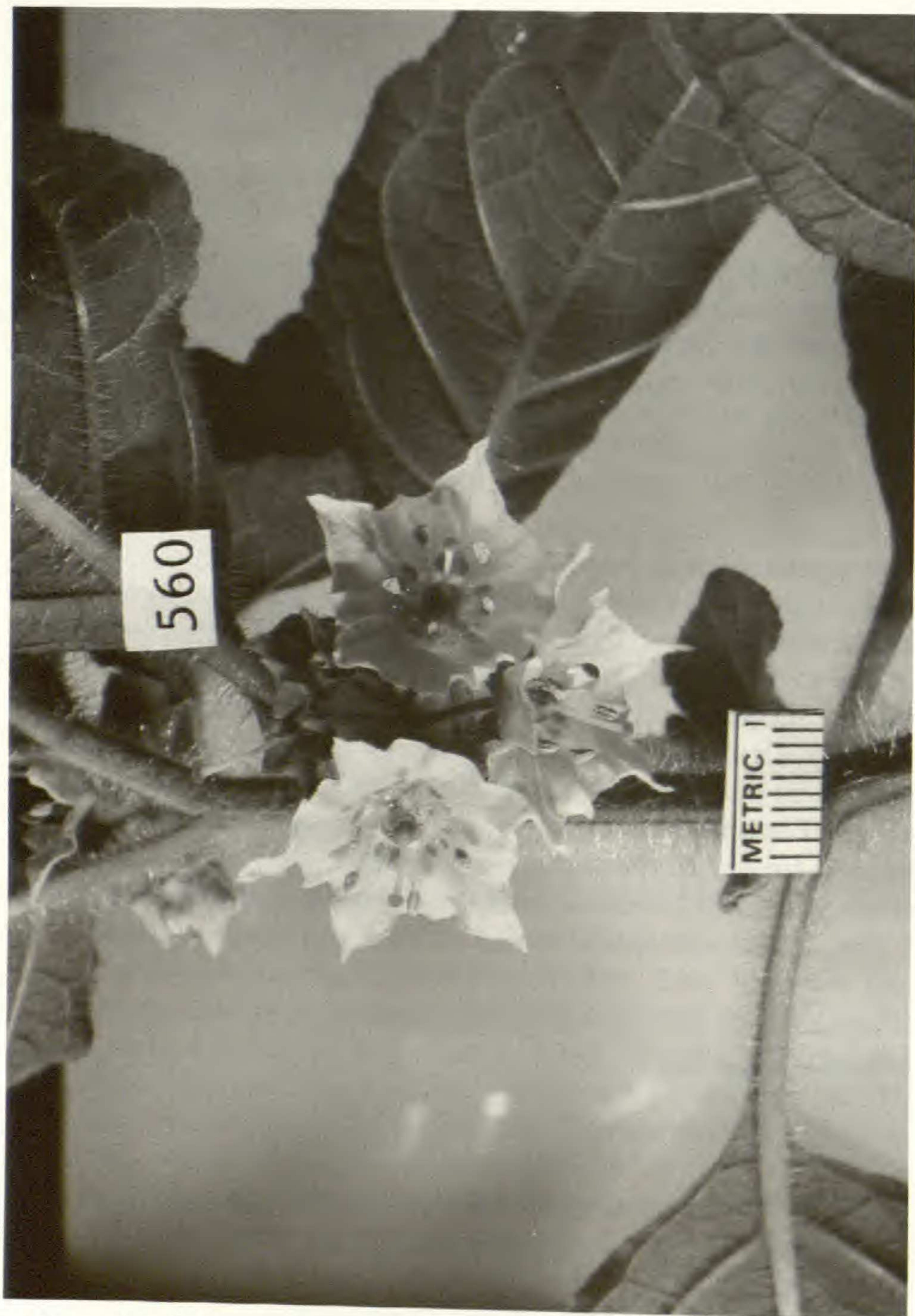
Figure 1. Jaltomata lojae . Inflorescence on plant grown from seed of the type collection. Units are millimeters.